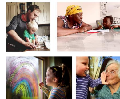
A showcase of our children's experiences in 2020.

Send your entry to: halsford.pta@gmail.com